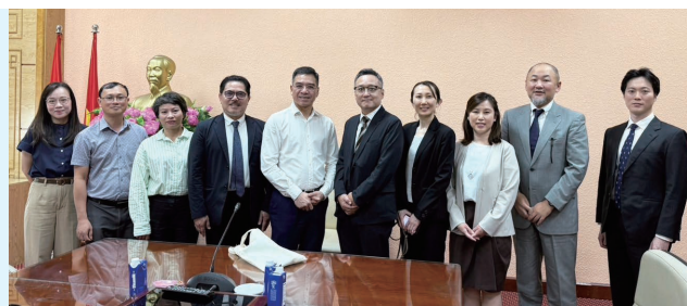
The Ministry of Health, Vietnam