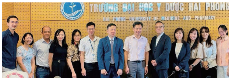
DIT-JIHS and HPMU teams during the kick-off meeting

To conduct the project's kick-off meeting, the DIT