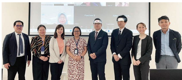
The Department of Public Health, Thailand