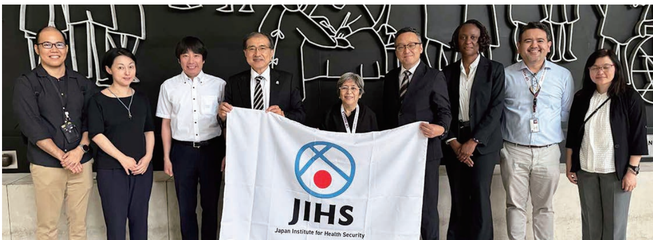
Group photo of the UPM and JIHS teams in front of the wall mural depicting the building where the NCTTC and JIHS Collaborating Office are located

The renaming of the NCGM Collaborating Office to the JIHS Collaborating Office was marked by a brief gathering on July 21, 2025, at the National Clinical Trial and Translational Center (NCTTC) of the University of the Philippines Manila (UPM), where the office has been housed since its establishment in 2021.