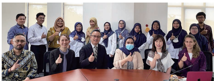
The Ministry of Health, Indonesia