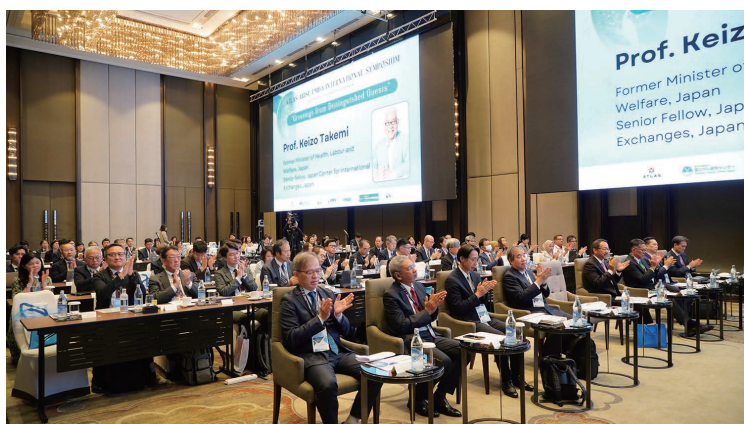
During the opening speech by Dr. Keizo Takemi