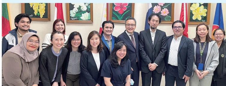
The Department of Health, the Philippines