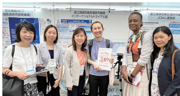
Attending DIT members in front of the DIT booth