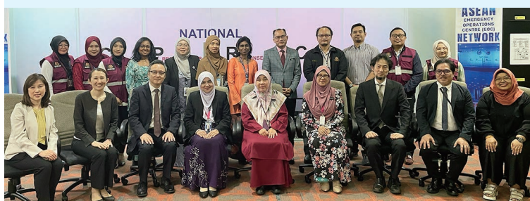
The Ministry of Health, Malaysia