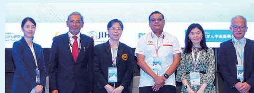
Session 5 chair and panelists

The "ATLAS-ARISE-PMDA International Symposium 2025" took place on October 3, 2025, in Bangkok, Thailand. Approximately 100 people attended, including representatives from the National Cancer Center, the JIHS, the Pharmaceuticals and Medical Devices Agency, Mahidol University, former Japanese Minister of Health, Labour, and Welfare, Dr. Keizo Takemi, the Embassy of Japan in Thailand, JICA, and other guests.