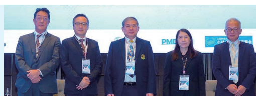
Session 3, organized by ARISE, chair and speakers